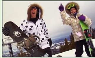
Pray About Everything