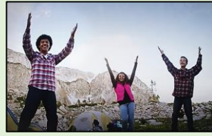
My God Is Powerful