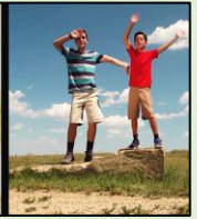
Good in Every Way