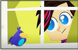
I Can Pray