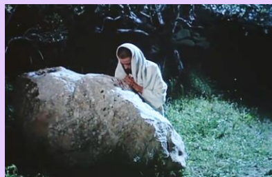
Jesus in the Garden